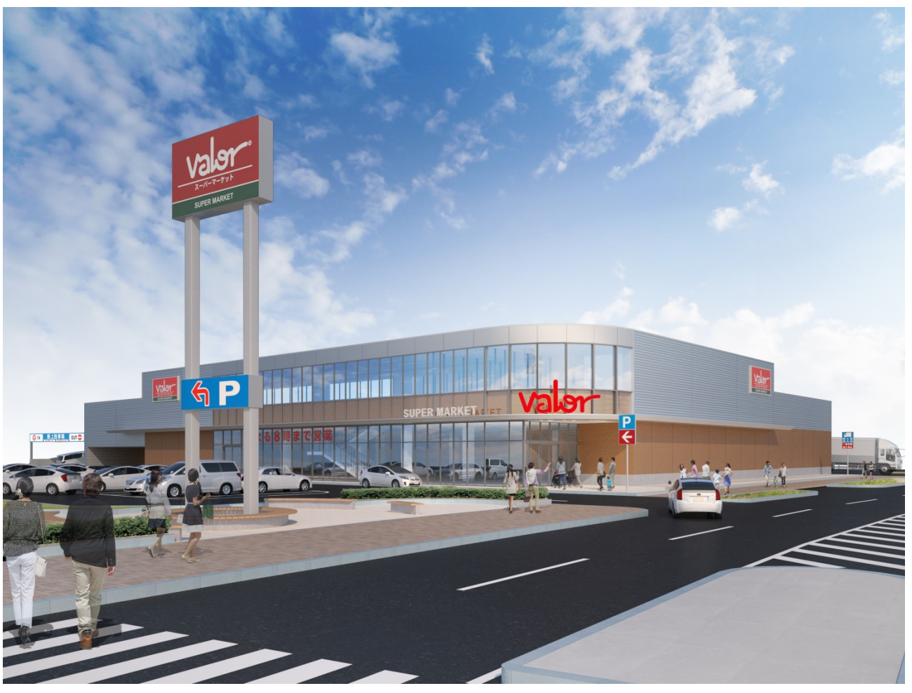
(Note) Hankyu Hanshin REIT is scheduled to acquire the land only. Also, the building is currently under construction and the above figure may differ from the situation after completion as it envisions the building after completion.